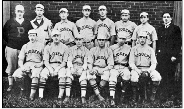
The 1912 Hawks defeated the World Champion Philadelphia A's in an exhibition game at Shibe Park.